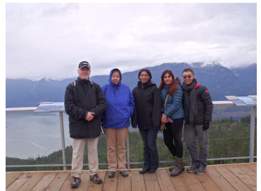
North Shore Team